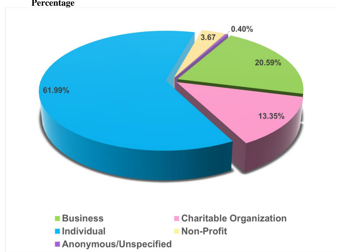
<u>Figure 3</u> - Team Western Kentucky Tornado Relief Fund Donations By Source - Percentage